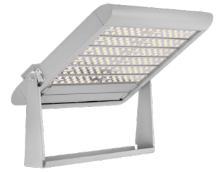
AUR-450 Trunnion mount