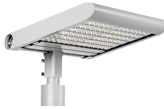
AUR-450 Slip Fitter mount